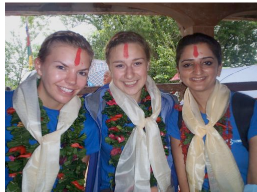
Leaving ceremony with our Nepalese supervisor

Overall I found the experience of a third world country both exhilarating and overwhelming. Some areas were polluted, crowded, and dilapidated, but others were of outstanding natural beauty. I am privileged to have been able to travel to that area of the world, and proud that I was able to provide free dental treatment to people in great need of it. The villagers of Dandakharka made us feel welcome, and enjoyed