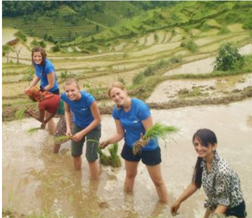
Helping out at the weekend planting rice

The future oral health of the villagers was an issue. Although oral hygiene instructions were given to everyone, patients need repetition and follow-up to modify their behaviours. Some oral health promotion techniques could have been taught to the village healthcare workers so that they could help prevent diseases arising in the future.