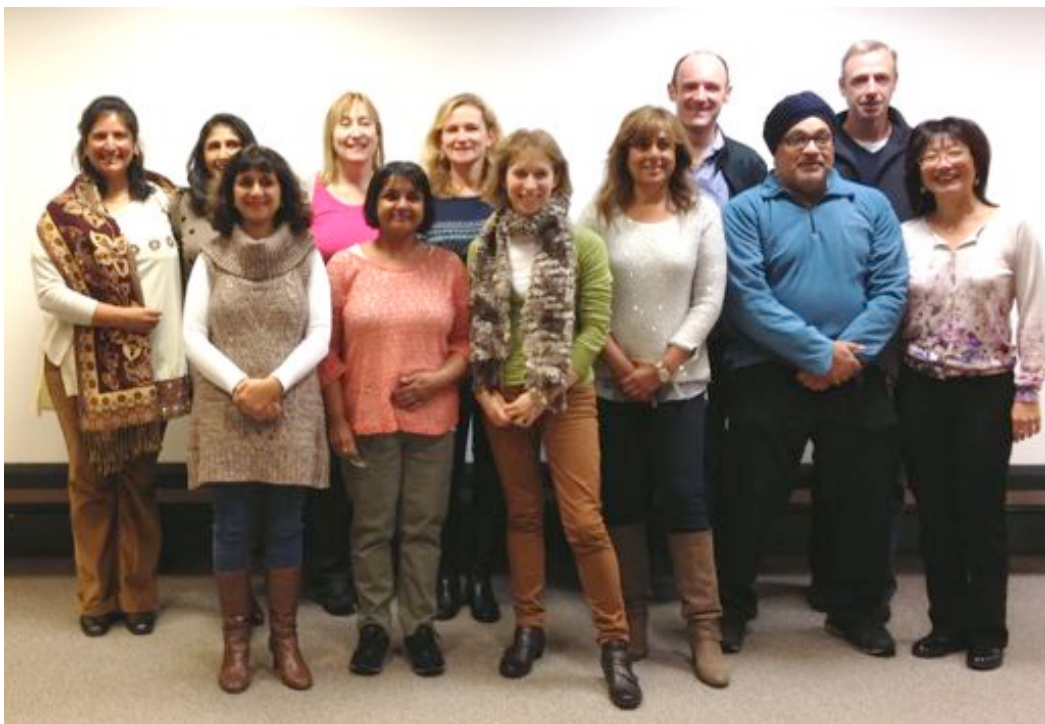
Year of 1988 before the Dental School tour