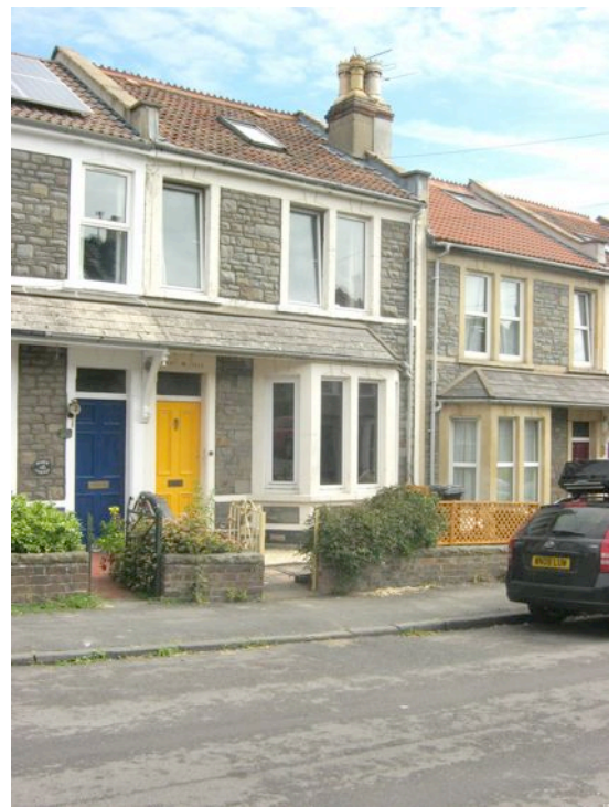
Figure 2. 41 Monmouth Road