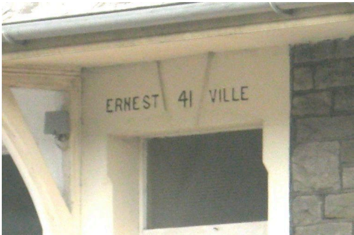
Figure 5. The inscription above the front door of 41 Monmouth Road