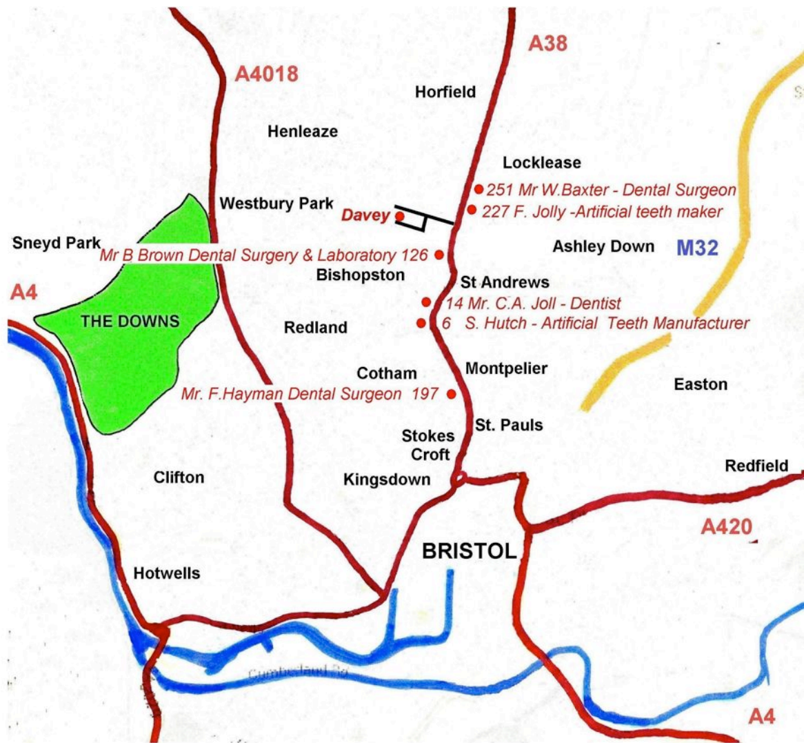
Figure 7. Dental Practices in North Bristol in 1914

Perhaps the most likely of these was the nearby practice of Mr. B.G. Brown at 126 Gloucester Road, barely two minutes walk from Monmouth Road, and which claimed to have a dental laboratory on the premises (Fig. 8).